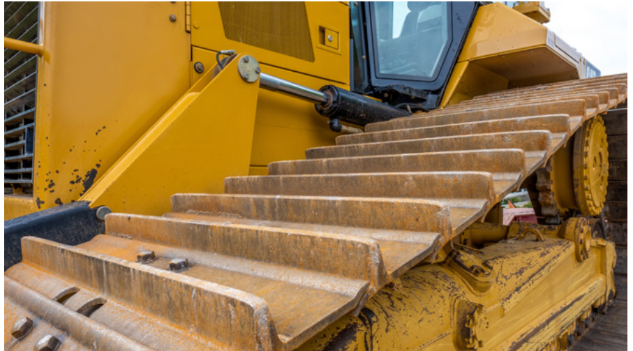
Bulldozers will be used to remove existing structures on the site.

New native trees will be planted in the landscaped areas on site and along the street.