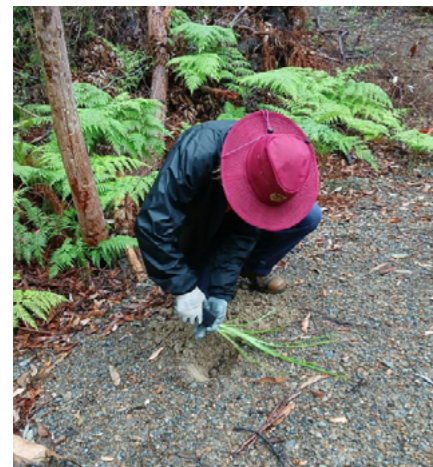
Planting of native species as part of site remediation