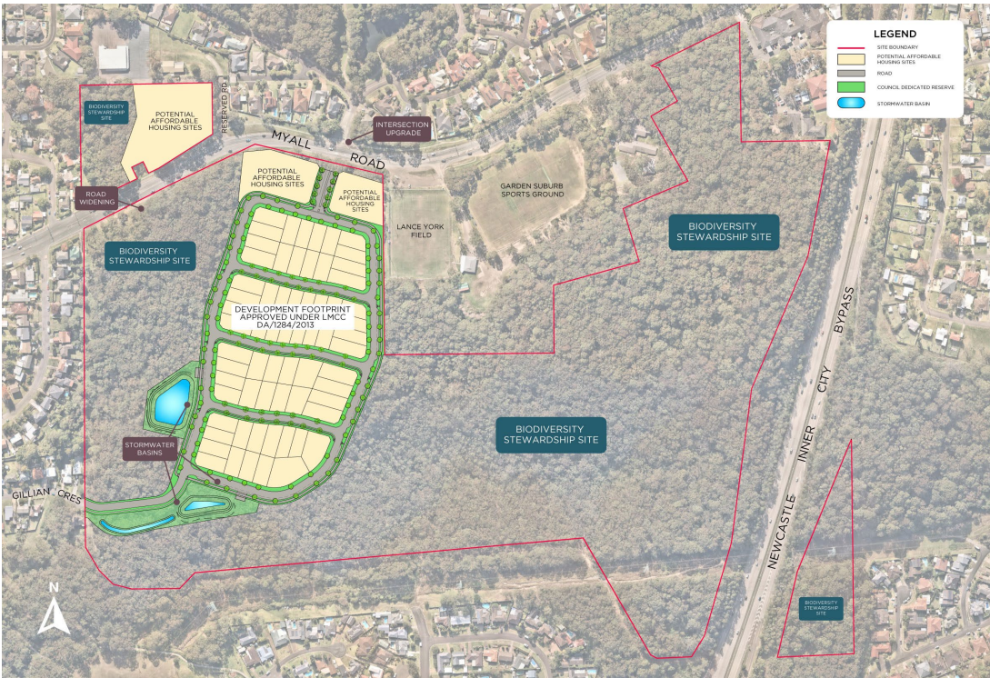
Figure 1: Garden Suburb Masterplan