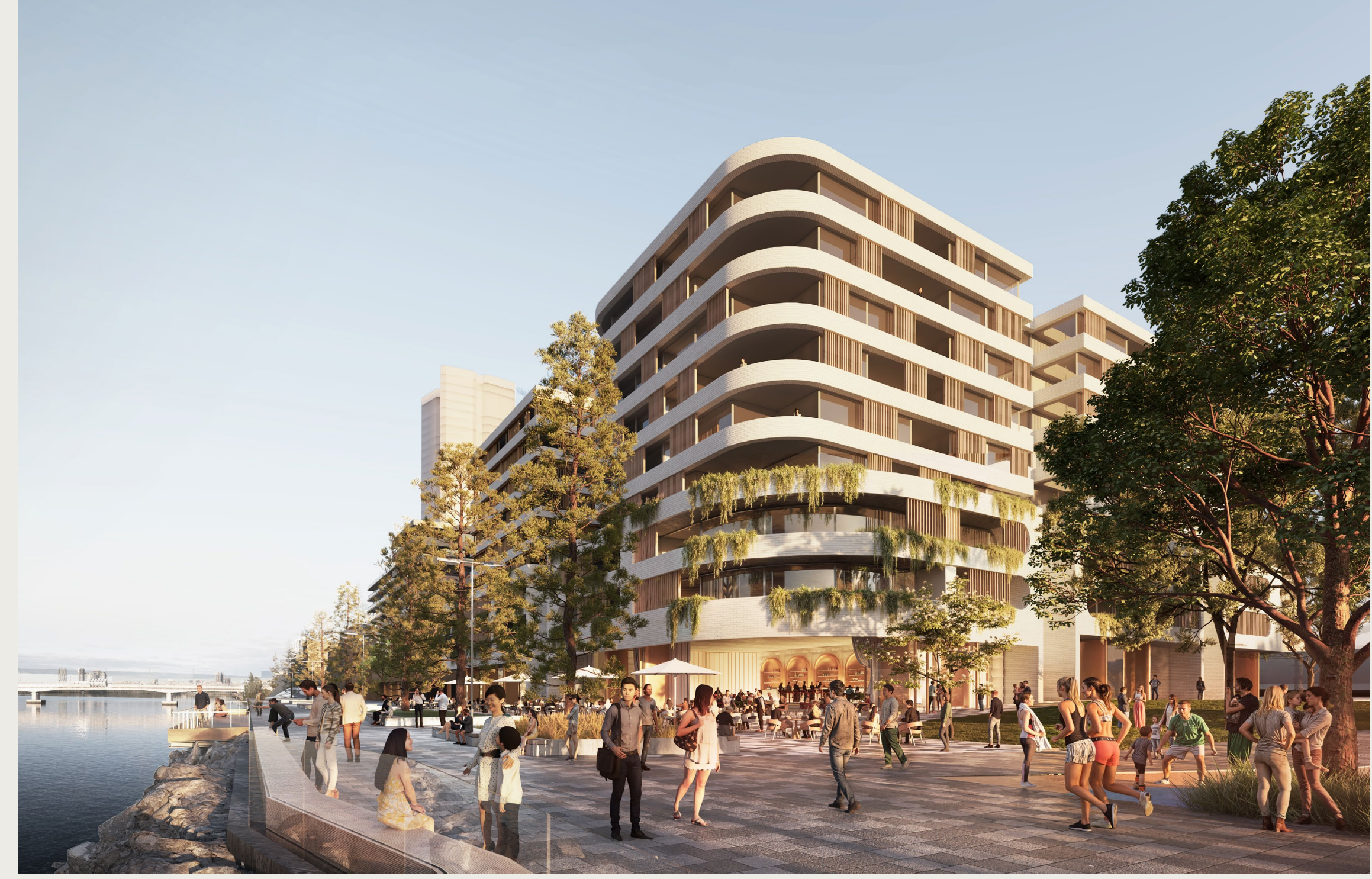
Artist's impression of the view to the west, showing the plaza and through-site link between the two proposed mixed-use buildings

Artist's impression of the view to the south, showing the waterfront walkway where the proposed mixed-use buildings meet the peninsula park